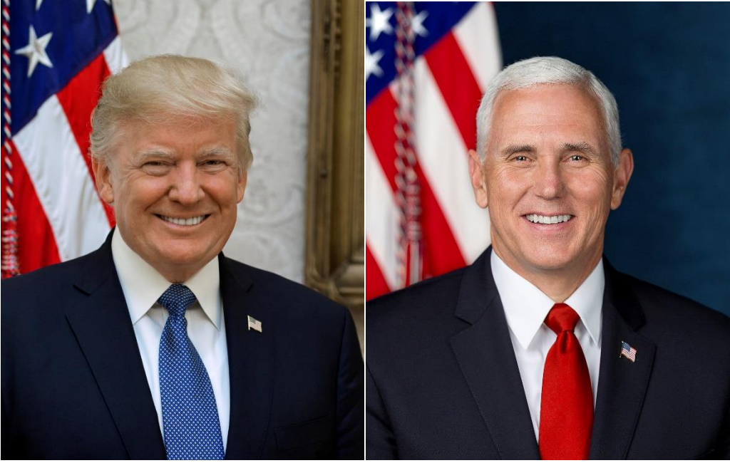
President Donald Trump Vice-President Mike Pence