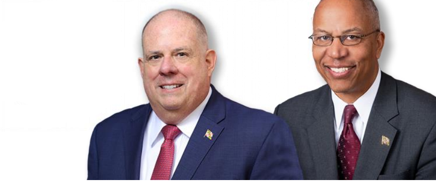
Governor Larry Hogan Lt. Governor Boyd Rutherford