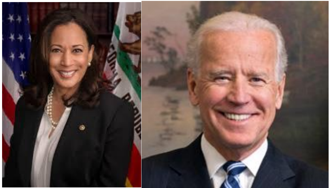
President-Elect Joe Biden Vice-President-Elect Kamala Harris