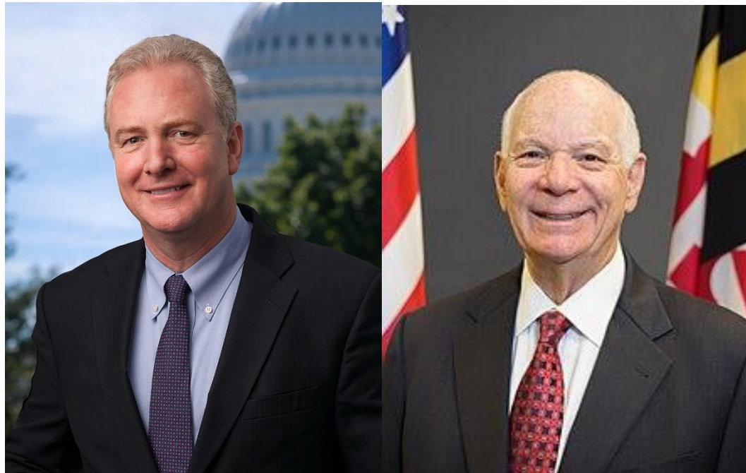
US Senators for Maryland Chris Van Hollen Ben Cardin